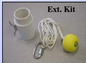
Case for Two Piece Unit